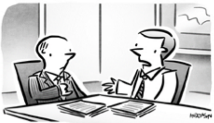
“The contract is signed, so a pinky swear seems like overkill, but if you insist.”

Claim your FREE copy today at www.networkbrainiacs.com/VoIP